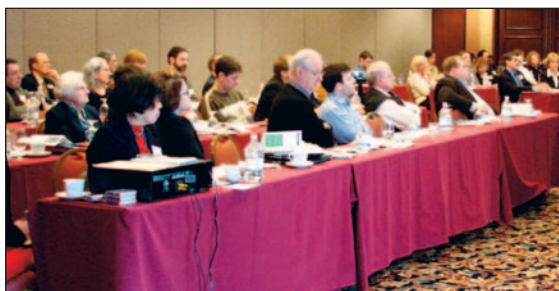
From physicians and residents to practice managers and registered nurses, this year's seminar drew a wide variety of NE Ohio health care professionals.

Jointly sponsored by the AMC/NOMA, the Academy of Medicine Education Foundation and St. Vincent Charity Hospital, the seminar in aggregate was intended to inform attendees not only on what policies and initiatives have already taken